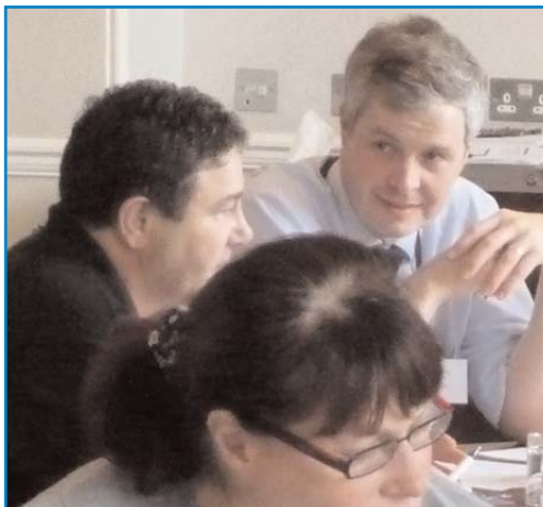
Some of the reps at York

It was interesting to find that the perceived level of risk was varied, highlighting the challenge of interpreting each report. However, there was agreement that enough information had been provided in order to resolve the issue - this is a difficulty facing the Research Team who must maintain the