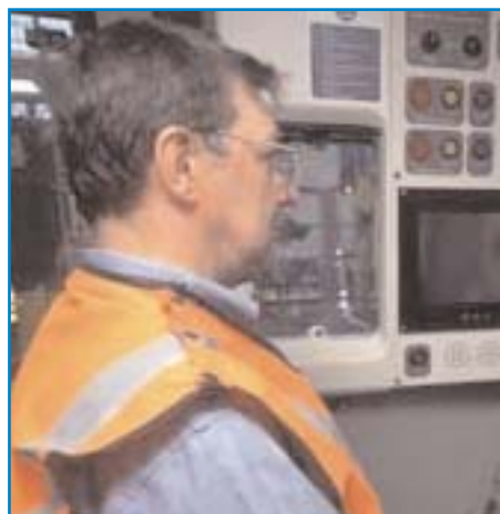
Bifocal lenses can cause a blind spot

A reporter had concerns over Southeastern's policy of banning the use of varifocal lenses. This meant some staff had to wear bifocals even though they found them problematic, because the line across the lens causes a blind spot. This blind spot resulted in staff having to peer over the top of the glasses which makes wearing them futile. Wearers also had to tread carefully when walking down stairs at a station or boarding and alighting, especially in an emergency situation when they would have to react quickly. The reporter stated that wearing bifocals or varifocals is dependent on individual needs and asked if conductors could be allowed to choose what they feel safest wearing and what suits their needs best. Southeastern