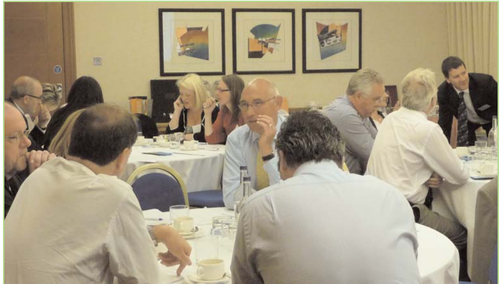
The London meeting was fully booked!

The new-look format of the CIRAS reps' meetings proved to be a success, with around double the number of reps attending these meetings compared to the last meeting in December.