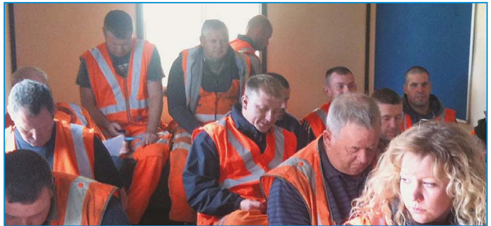
BCM Construction staff safety brief

These visits, and many others, provide CIRAS with invaluable contact, enabling us to keep in touch with your thoughts and concerns.