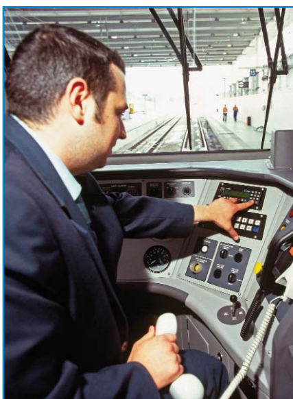
29% of CIRAS' occupational health reports relate to work environment issues.

Not far behind is work environment (29%), including issues such as uncomfortable seating positions in train cabs, or poor lighting and excessive noise. CIRAS reporters are less concerned about slips, trips and falls and mess facilities (15% each). Finally, potential exposure to hazardous substances, such as asbestos and ammonia, accounts for 9% of CIRAS reports in the occupational health area.