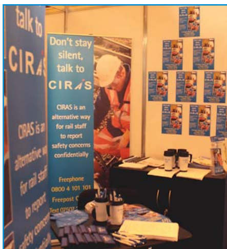
Railtex Conference, Earls Court, 2011